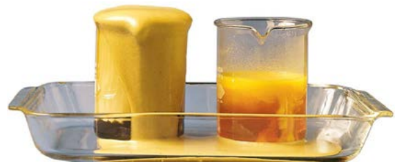
Competitive Product with Dangerous Foam

To demonstrate its capability as a low-foam product, Liquid Scale Dissolver was added to a beaker containing lime scale. A leading competitive hydrochloric acid based product was added to another beaker containing an equal amount of lime scale. The difference is dramatic. When cleaning towers and evap condensers, low-foam is the preferred approach as high foam is both dangerous to personnel and surroundings and it represents wasted acid.